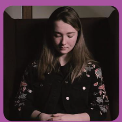
GB Ministries is the operating name of The Girls' Brigade England & Wales; a company limited by guarantee (No.206877) and a registered charity (No.206655).