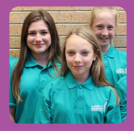
Trustee Board Recruitment Pack